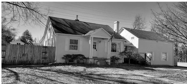
Welcome House Belle Morris

We cannot help them all, but we can welcome those who come to Knoxville. God is sovereign and migration is part of HIS redemptive plan. Acts 17:26-27 says God determines the exact places where we should live including Knoxville, TN!