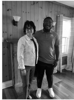
Welcome House Kingston Pike